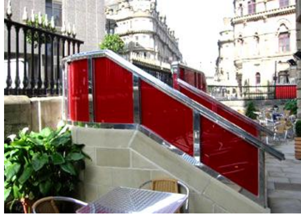
Private House (left) Station Hotel (above)