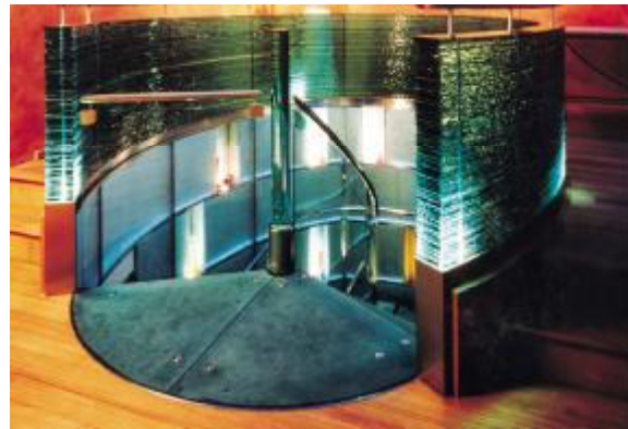
Famous Composers Residence London